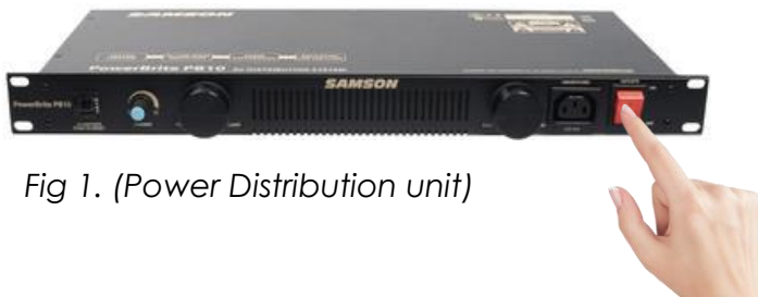
Fig 1. (Power Distribution unit)